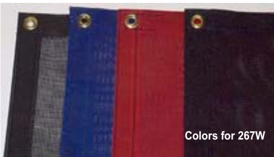
Colors for 267W

One of the industry's best values and perfect for your baseball field! Made of 7-1/2 oz. vinyl-coated polyester (80% opacity). 3-1/2 ply hems include an 18 oz. vinyl tape insert for added strength Brass grommets spaced every 12" along perimeter for a professional looking installation. 6" or 9" heights. Available in Red, Dark Green or Black. 2-year warranty.