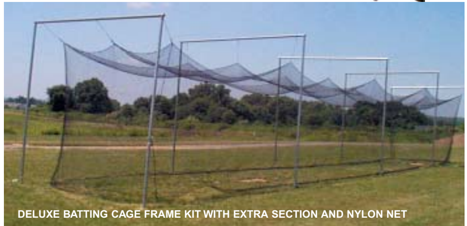
DELUXE BATTING CAGE FRAME KIT WITH EXTRA SECTION AND NYLON NET

Backstop Vinyl Pad 3533 Reduce ball bounce within backstop or practice cage with this tough vinyl covered high density, protective foam pad. Size is a full 72" x 52" by 4" thick with brass grommets for easy installation. UV resistant vinyl and special thread stand up to the elements and provide long life. 6 lbs. (not shown)