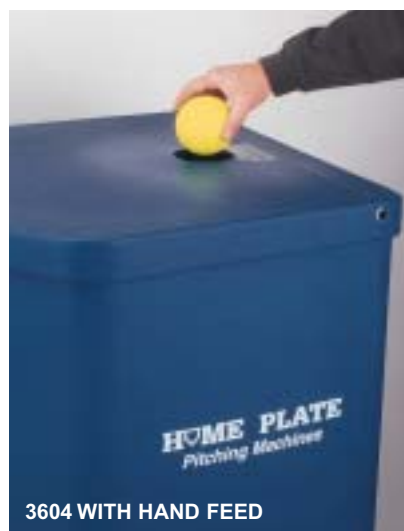
3604 WITH HAND FEED