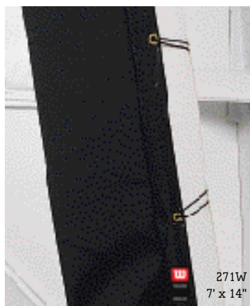
271W 7' x 14"