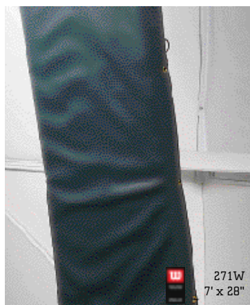
271W 7' x 28"